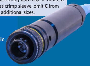
Terminated and tested MIL-PRF-28876 fiber optic cable assembly

Crimp sleeve is supplied with terminus assembly and may be ordered separately (see Table II). For terminus less crimp sleeve, omit C from end of part number. Consult factory for additional sizes.