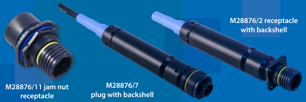
M28876/11 jam nut receptacle

Qualified MIL-PRF-28876 fiber optic connectors and MIL-PRF-29504 termini—Navy approved, in stock, and ready for immediate shipment