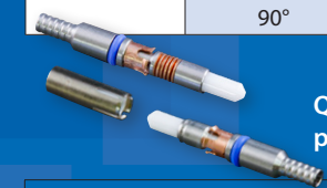
Qualified QPL-29504 pin and socket termini