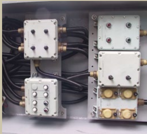
Complex installations fully supported with feed-thru fittings and wire protection conduit