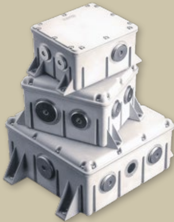
Broad range of sizes and shapes