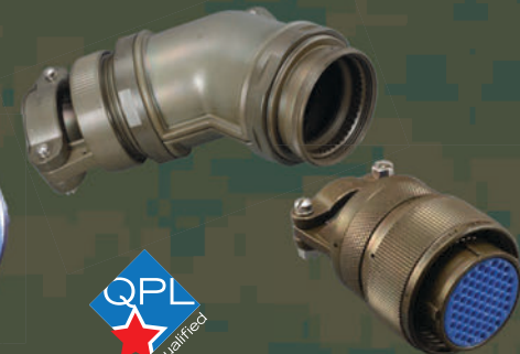
MIL-DTL-28840 shipboard connectors and accessories