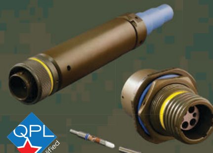
MIL-DTL-28876 shipboard fiber optic