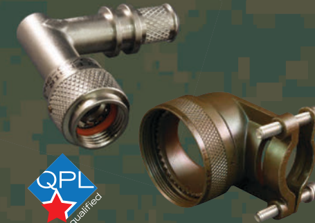
M85049 (AS85049) backshells and connector accessories