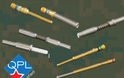
MIL-DTL-29504 (fiber optic) and AS39029 (electrical) contacts