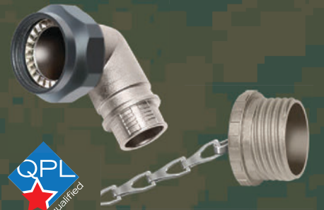
M85049 composite backshells and covers for MIL-DTL-38999