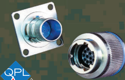
MIL-DTL-38999 Series IV environmental connectors