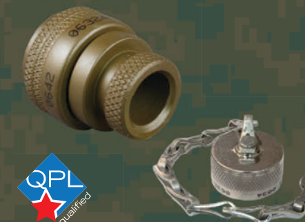
MIL-DTL-83723 backshells and connector accessories