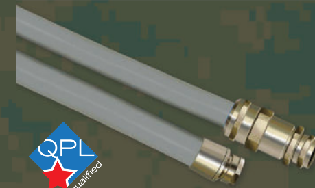
MIL-PRF-24758 Navsea-qualified conduit and fittings