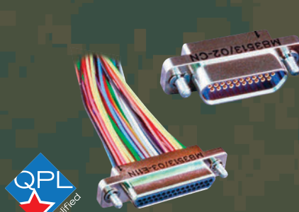
MIL-DTL-83513 Micro-D connectors and accessories