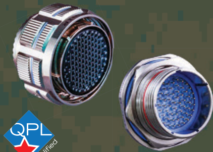
MIL-DTL-38999 Series III environmental connectors

Qualified Products: Glenair is a Mil-Aero connector supplier. Our product quality begins in engineering (the largest team in the high-performance interconnect business) and is realized in our “made in the USA” vertically-integrated manufacturing cells. One of the key ways we ensure both areas are functioning smoothly is to submit designs and manufactured specimens into the military QPL process administered by the Defense Logistic Agency of the US government. These certification exercises are multi-year activities that test every aspect of a connector’s performance.