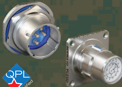
MIL-DTL-38999 Series I, II, III, and IV hermetic connectors