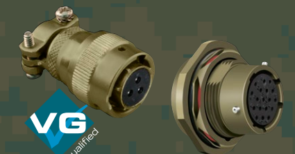
VG95328 Bayonet-Lock IAW MIL-C-26482