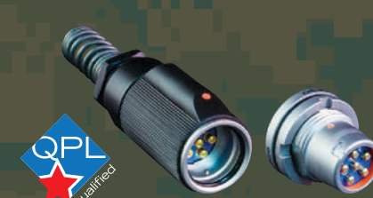
MIL-DTL-55116 Radio / Audio Connectors