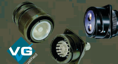
VG95234 Reverse-Bayonet and VG96929 Single-Pole