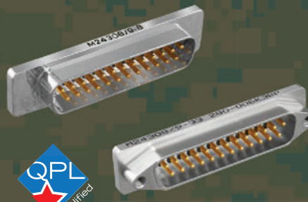
MIL-DTL-24308 hermetic connectors