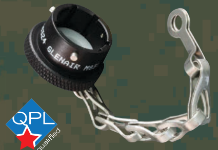
M81511 (AS81511) protective covers and connector accessories