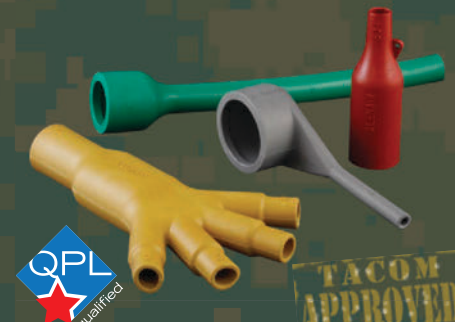
M85049/140 series qualified / TACOM-approved environmental shrink boots