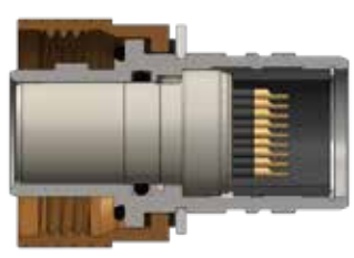
Cable Connector Plug (CCP)